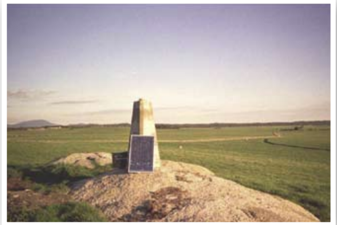
AAM Monument Points