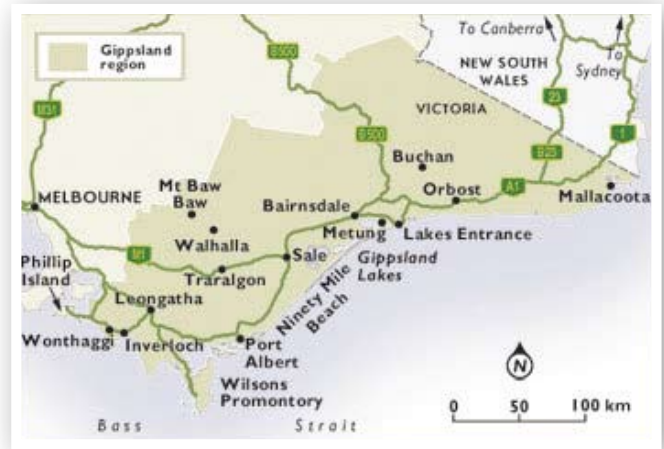
Map of the Gippsland Coastline

The unprecedented combination of high precision measurement and large area extent required innovative design and use of specialised equipment, rigorous error mitigation in data capture, and sophisticated data processing methods in order to meet the project specifications – truly setting a new national benchmark of excellence in the key area of subsidence monitoring.